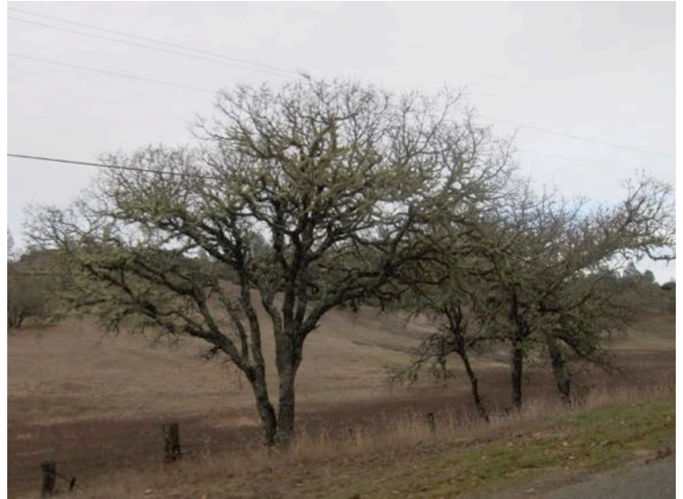
A December landscape in Pope Valley of roadside oaks with lichen.