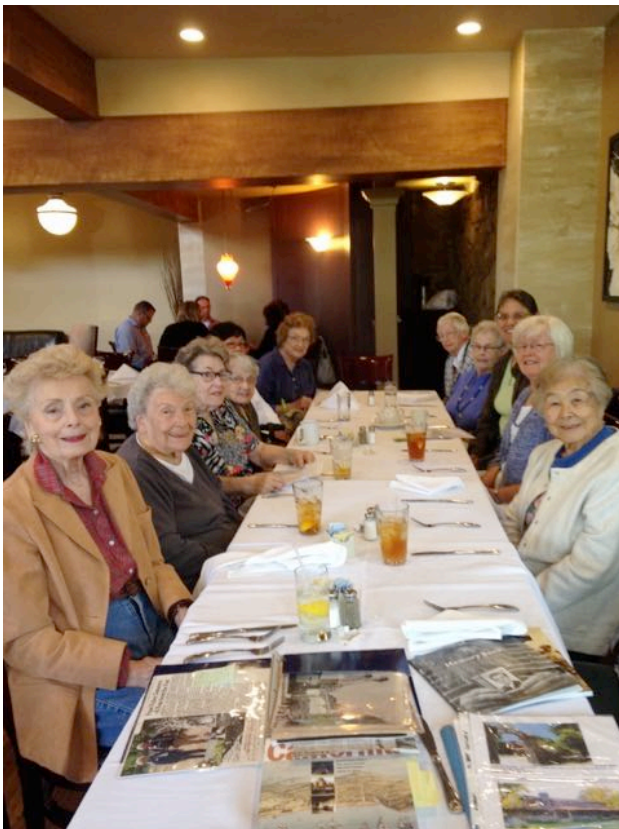
The Key November 2015